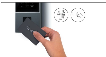
Clocking with RFID proximity card, Fingerprint or PIN code

* After the 30-day trial, choose your subscription: TimeMoto Cloud or TimeMoto Cloud Plus